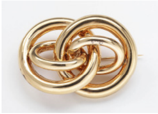
Brooch Benckiser u. Co., Pforzheim 1860