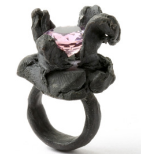
Ring Karl Fritsch 2004

Flowers are among the most ancient motifs in art. The interdisciplinary exhibition about this floral topic presents historic jewellery as well as pieces of contemporary jewellers. Another spotlight is on plants and blossoms as the subject of artistic reflection in our days' art, including drawings from nature, artificial parallel worlds as installations and, specifically, a video documentary on one woman's obsession with the amaryllis are to be shown. The unusual confrontation of contemporary jewellery and the visual arts is what lends weight to this project. It will also include the municipal garden around the museum building.